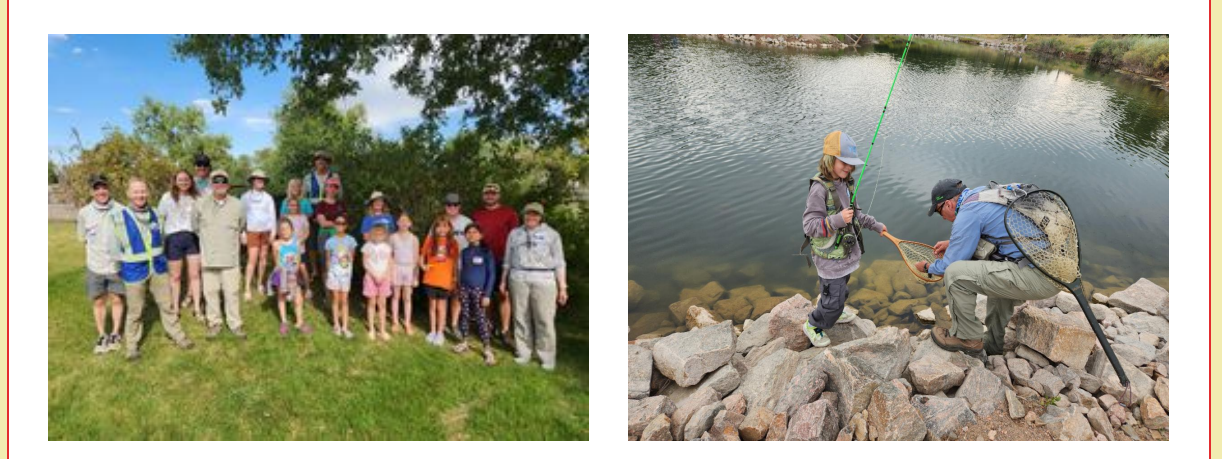
RECAP: Stream Girls

CCTU held successful STREAM Girls 1.0 and 2.0 events this past weekend. Thank you to Cyndy Scholz who led the events, and to all our volunteers from Cutthroat Chapter TU, West Denver TU, Colorado Women Flyfishers, AvidMax, and parents and troop leaders.