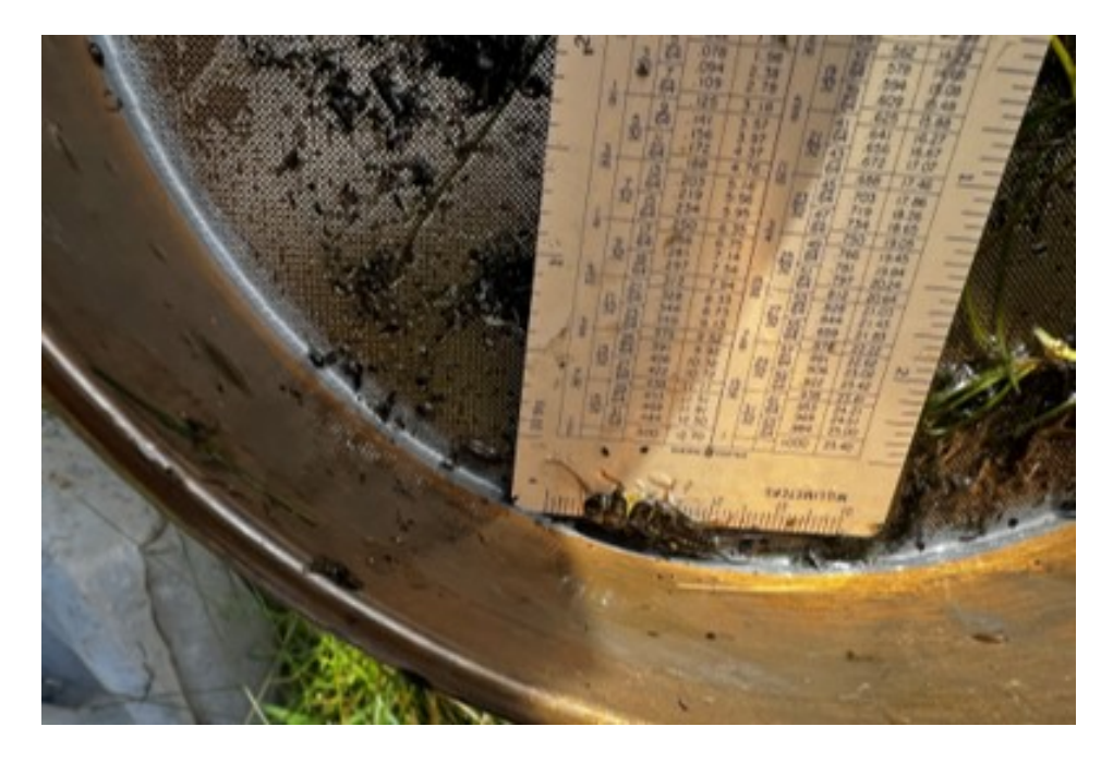
Washing out the dirt and grass to find the bugs