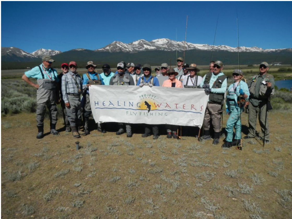
June 29, 2023 Project Healing Waters, Crystal Lake