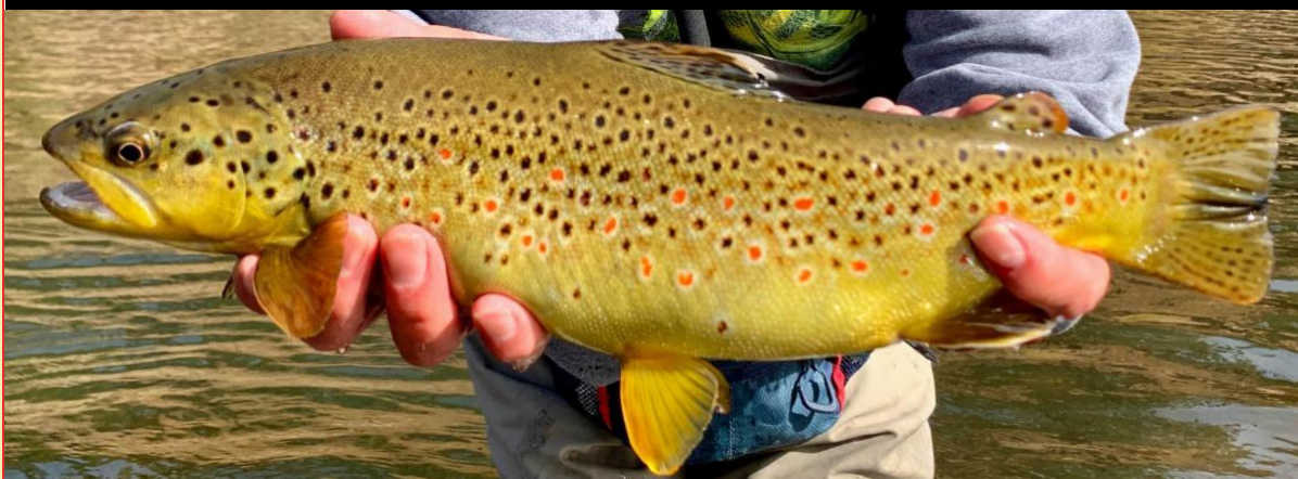
Ray Nagashima, South Platte River near Deckers, #20 Blue Quill - 10/16/20