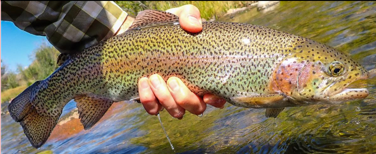
Colorado River, Fastwater Prince - 9/1/20