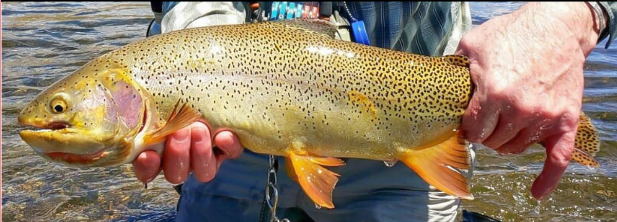
Rich Hus, South Park - 7/10/20