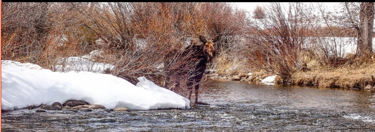
Colorado River - 3/18/20