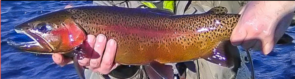
Dan Hodgkiss - North Platte River, 2/28/20