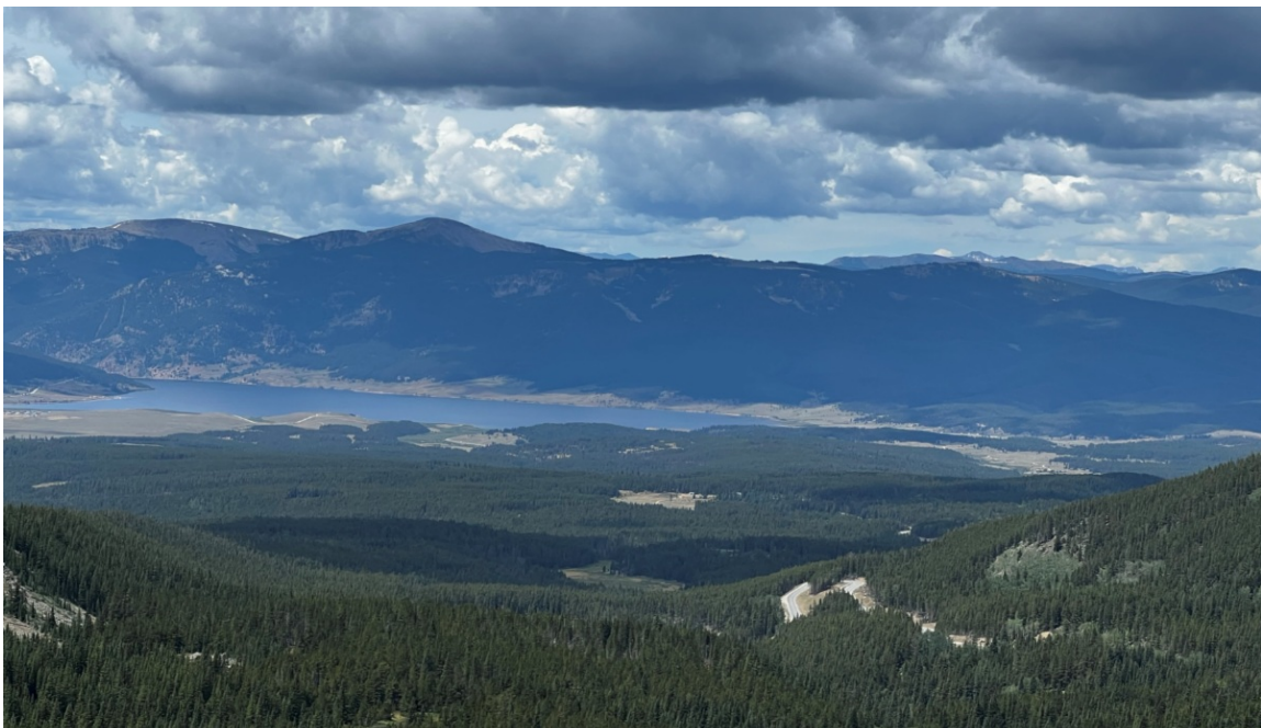
View of Taylor Reservoir from Cottonwood Pass