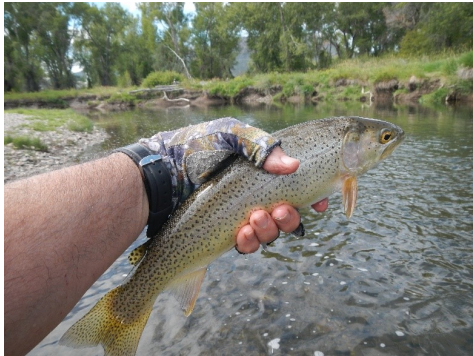
The beautiful day produced a nice fish for Allen.

On August 24th seven folks made the long two and a half plus hour trip out to Gypsum Ponds to fish the Eagle River. We all arrived at Gypsum Ponds SWA a little past 10:30 due to a late start from the T-Rex Park and Ride because several people got tied up in Denver rush hour traffic. Gypsum Ponds SWA was a great option with a lot of fishable water and no crowds. The water temperatures were a bit high pushing 60 degrees which kept the fishing a bit slow. However nearly everyone had a fish story or two to share by the end of the days with both dry flies and nymphs being equally effective. The blue skies turned to afternoon thundershowers around 4 pm chasing everyone back to our rides. The group headed home about 4:30 and everyone agreed that the long trip over to the Eagle was well worth it. Thanks to Dr. Allen Adinoff for the great pictures.