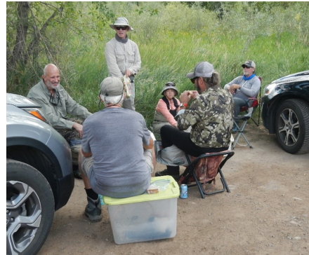
Lunch was a good time to swap stories and tactics before heading back out for the afternoon.

For our September trip we are closer to home and fishing Clear Creek!