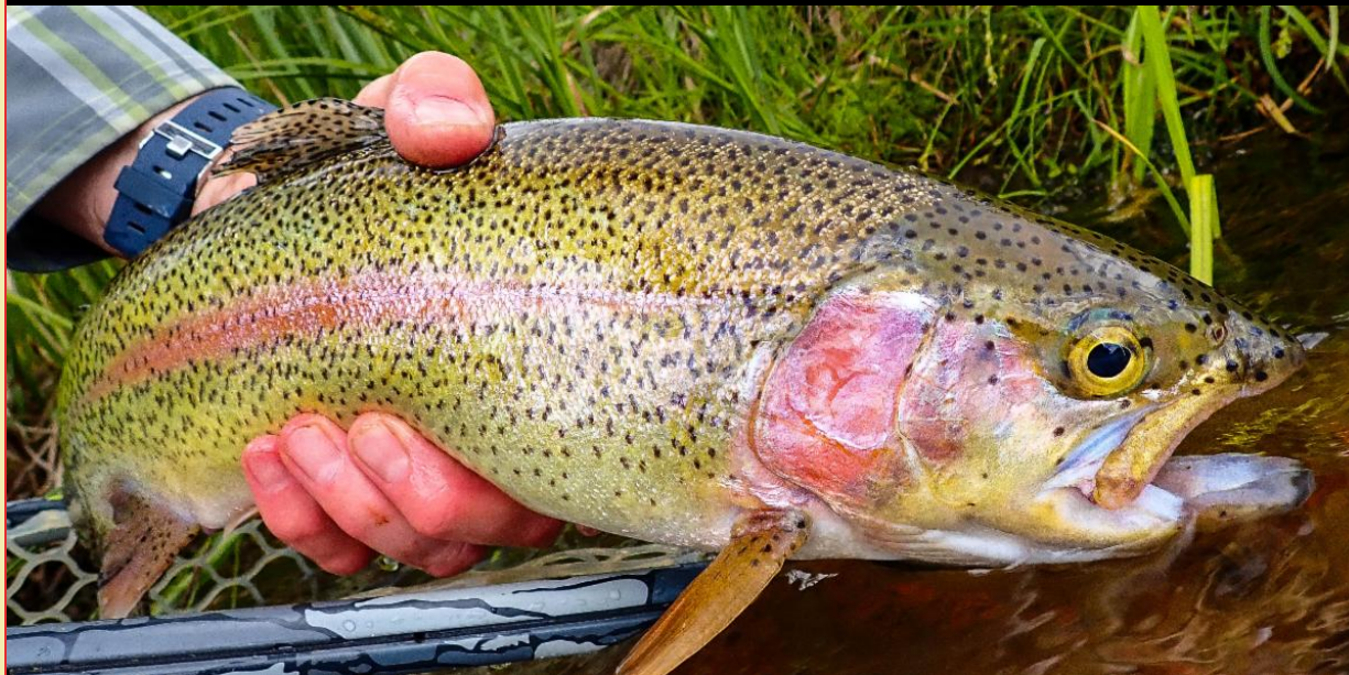
Colorado River, June 28, Micro Mayfly Jig