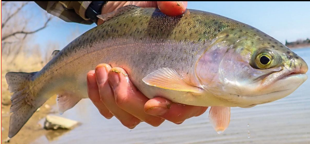
Hine Lake, May 4, K.G.B. Tactical Nymph