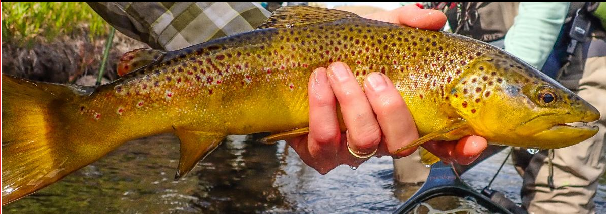
Colorado River, Schroeder's Hopper - 8/11/20