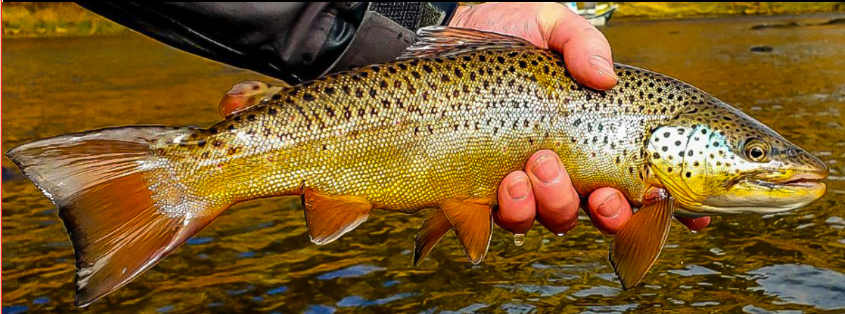
Rich Hus - CCTU San Juan River Trip, 10/26/19