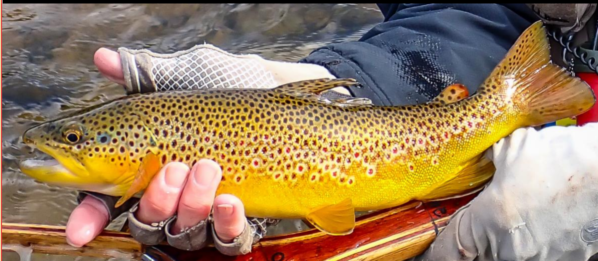
Jlm Klug, Colorado River - 8/23/19